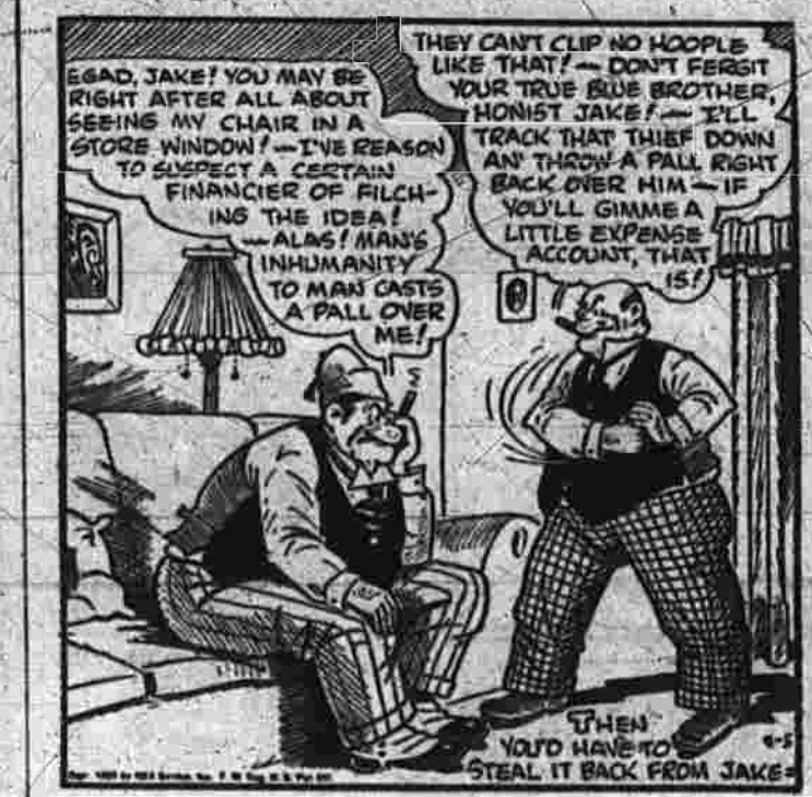
ALLEY OOP BY V. T. HAMLIN