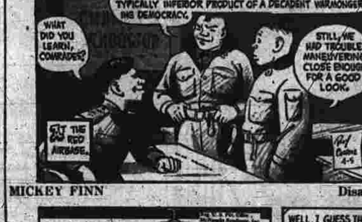
MICKY FINN Disappointing! BY LANK LEONARD